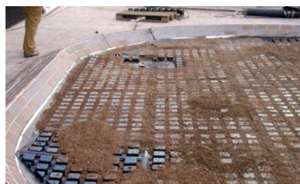
The drainage element Floradrain® FD 60 provides sufficient water retention capacity and made the old permanent irrigation system superfluous.