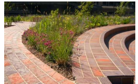
The planting beds were kept to the original layout, however, the vegetation was completely replaced on top of the newly laid out FD 60 build-up.