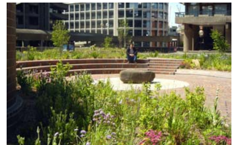
A naturalistic meadow-like wildflower vegetation was chosen tolerating low water availability and requiring little maintenance throughout the year.