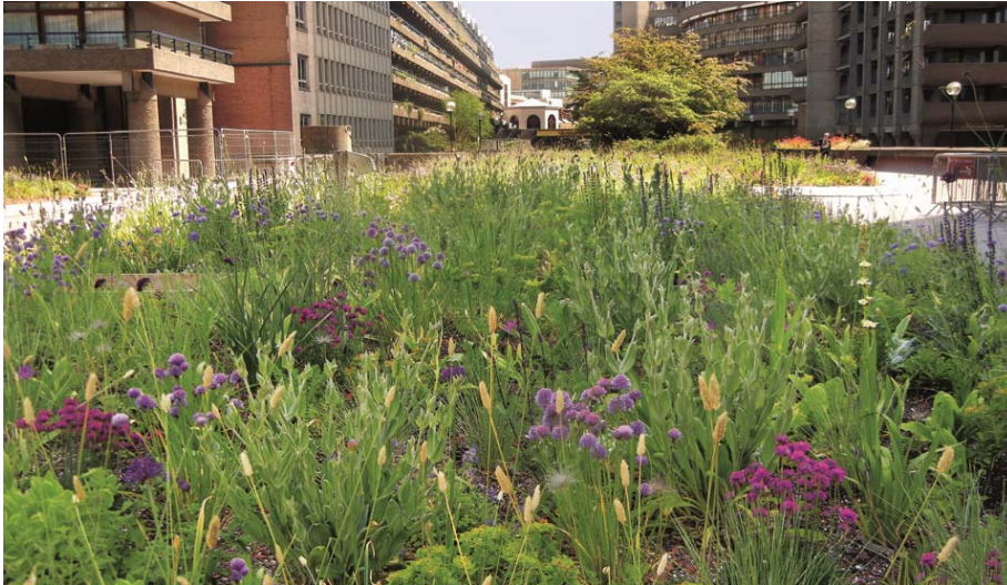
Beech Gardens as part of the Barbican Estate provide recreational green space in the City of London.