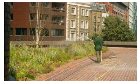
Additional hand irrigation is only required during the first year establishment phase.